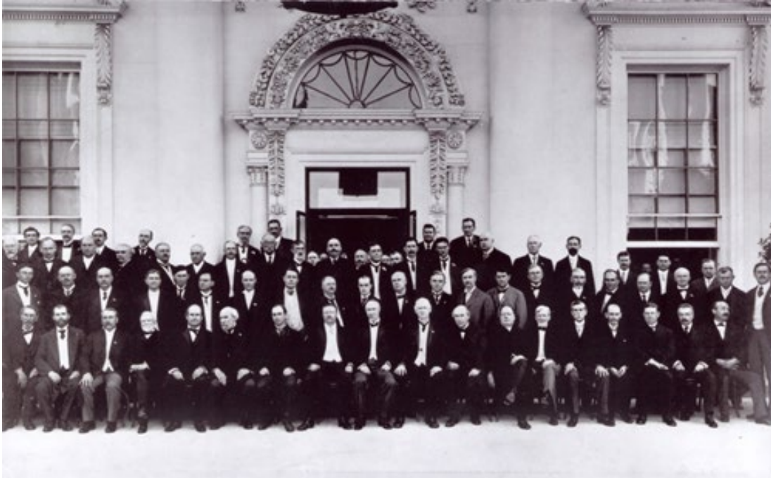
Image: The first meeting of the National Governors Association in 1908.

The May 1908 meeting of President Theodore Roosevelt and governors led to the creation of the National Governors Association.